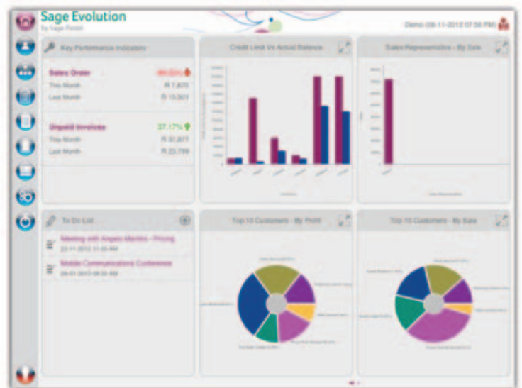
The screen above is an example of the home screen. This screen can be customised per user.

Sales executives and business managers can access real-time information enabling them to operate more efficiently. This extends your organisation's borders allowing you to transact anywhere, anytime. Transform your business by enabling in-the-moment sales order creations and increase field sales force productivity with Sage Evolution Mobile.